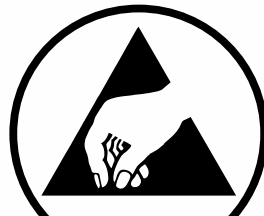
ESD PROTECTIVE SYMBOL