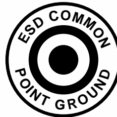
ESD COMMON POINT GROUND SYMBOL